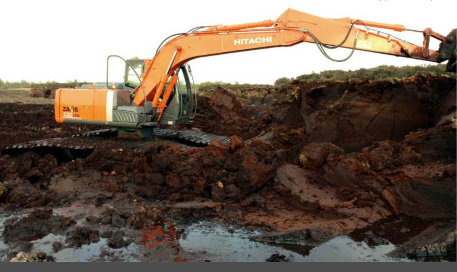
Working in Scotland on peatland restoration