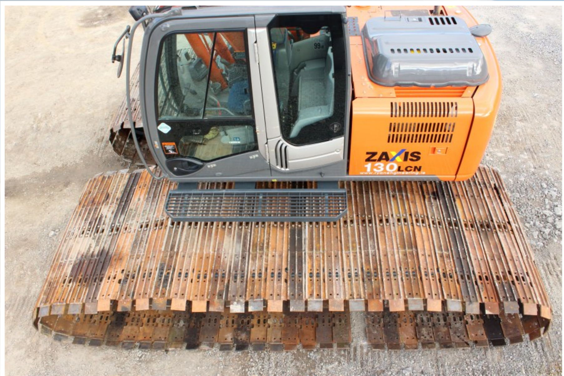
Ultra low ground pressure excavator Undercarriage